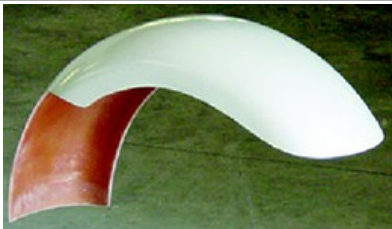
Rigid Rear in 9" & 11"