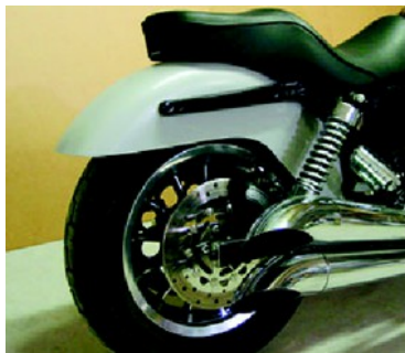
Part # 8732 Dyna 02-05 Models