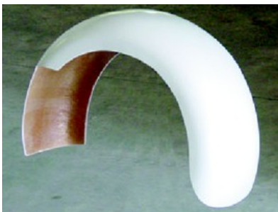
Rigid Rear Extended in 9" & 11"