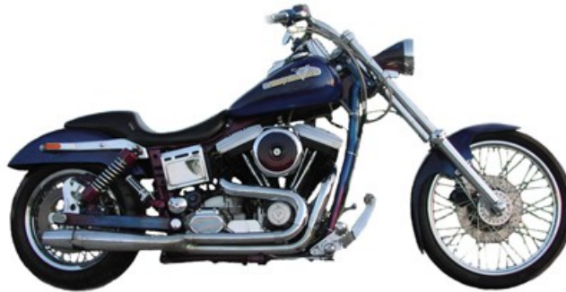
Above picture, Part # 8716 Dominator Rear with Part # 8635 Dagger Front

Our composite fenders are all made at our facility in Upstate New York with all 100% USA made raw materials. Composite glass techniques make our fenders lightweight, yet very strong. The top of the rear fenders have been structurally tested to withstand 28,000 PSI, that is stronger than your OEM steel fender. Fenders do not come pre-drilled so you can profile your seat for an exact fit and desired look. We do not guarantee any paint jobs and do not accept fenders back that have holes drilled in them. See Fender Mounting Tips