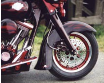
Part # 8654

4.75" Mounting tab to tab Narrow Glide Front Fender found on Sportster, Dyna, Early FX Models with 19" (100/90-19) Tires $239.00 Click Here to Order