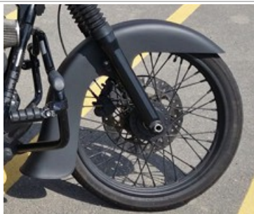
Part # 8712