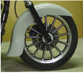
Part # 8713